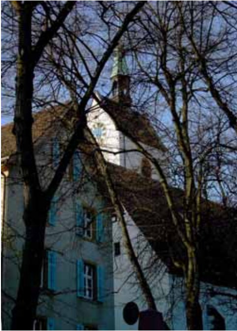
Figure 2a: Euler's childhood home in Riehen next to father's church