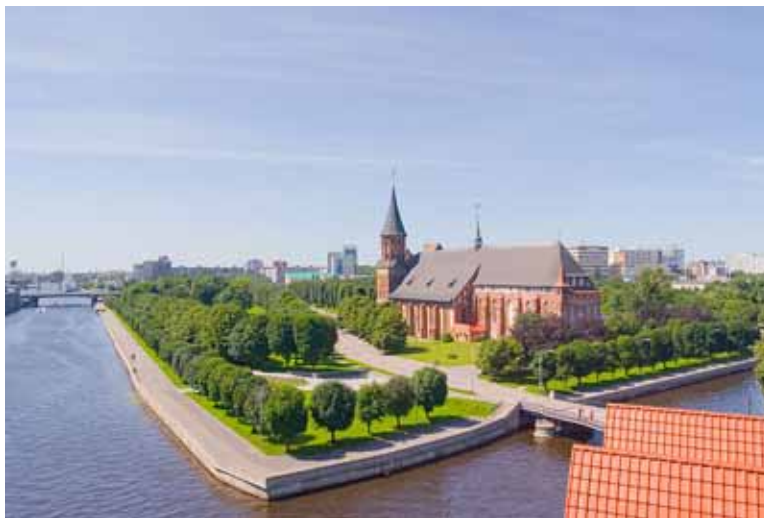
Figure 6: Present day Kaliningrad

Euler was very interested in geometric problems in which the concept of distance was not involved. He used the term geometry of position to describe such problems. Today we would include such problems under topology. An example of this type of problem is the Königsberg bridge problem. In the eighteenth century Königsberg was a city in Germany. It is now called Kaliningrad and is located in Russia. Figure 6 shows what present day Kaliningrad looks like. The Pregel river passed through Königsberg forming two islands as is shown in Figure 7a. There were seven bridges crossing the river. The problem was to see if there was a path a person could take that crossed each bridge exactly once and returned to the original starting point. Euler solved this problem in 1736, showing that it was not possible. It is often incorrectly stated that Euler solved this problem using graph theory [4]. It is true that today this problem is usually solved by making a graph as shown in Figure 7b.