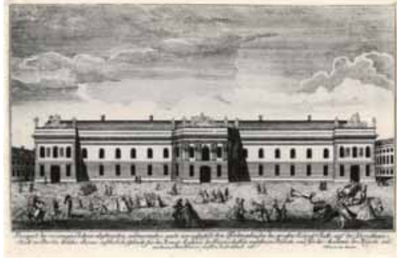
Figure 4: Drawing of the Berlin Academy of Sciences

letters were later published by the Saint Petersburg Academy in two large illustrated volumes. This work was tremendously popular with the general public and went through many editions. It was translated into French, English, German, Swedish, Italian, Danish, and Spanish. In the 25 years that Euler spent in Berlin he made important discoveries in the Calculus of Variations, established Euler's Identity for Complex Numbers, produced two treatises in analysis ( Introduction to the Analysis of the Infinite in 1748 and Foundations of Differential Calculus, with Applications to Finite Analysis and Series in 1755), and explored key concepts in algebra such as solutions of polynomial equations and the Fundamental Theorem of Algebra.