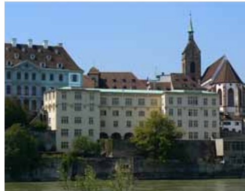
Figure 2b: The University of Basel

In 1723 (at age 16) Euler completed his Master's degree in philosophy. In his thesis he compared and contrasted the philosophical ideas of Descartes and Newton. He began the study of theology in the fall of 1723. However, he was still strongly attracted to mathematics. Johann Bernoulli finally convinced his father to allow him to change to mathematics. In spite of this change of vocation, his Christian faith remained strong throughout his life. He graduated in 1726. While in school he became close friends with the Bernoulli brothers Johann II, Daniel, and Nicolaus (sons of Johann). He was especially close to Daniel. In 1727 he won second place in the contest for the Grand Prize of the Paris Academy with an article on the best placement of masts on a ship. This was amazing since he, at this time, had never seen a ship. He would later win the Grand Prize twelve times.