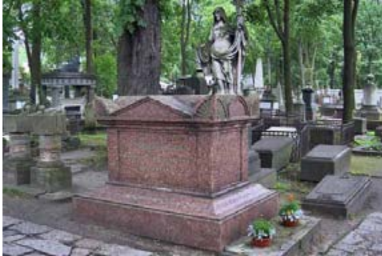
Figure 5: Euler's tomb in Saint Petersburg.