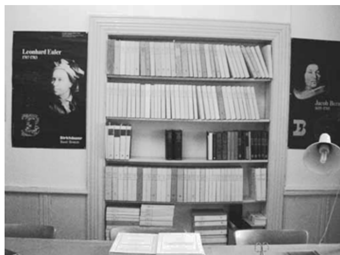
Figure 1: Opera Omnia at Euler-Archiv in Basel

Euler was certainly one of the most prolific scientific authors of all time. During his lifetime he had more than 500 books and articles published. An additional 400 of his manuscripts were published after his death. Historian Clifford Truesdell estimated that approximately one third of all publications in the fields of mathematics, theoretical physics, and engineering mechanics between the years 1725 and 1800 were authored by Euler [7]. Today mathematicians such as Euler are not well known by the public. However, in Euler's day, mathematics was considered the highest form of knowledge and he was better known by the general public than such literary and music greats as Swift and Bach. His collected works, entitled Euleri Opera Omnia , is contained in 80 volumes, many of which exceed 500 pages. A picture of this collection is shown in Figure 1.