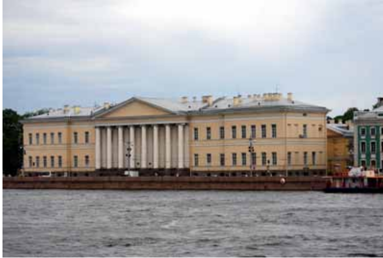
Figure 3: The Saint Petersburg Academy of Sciences