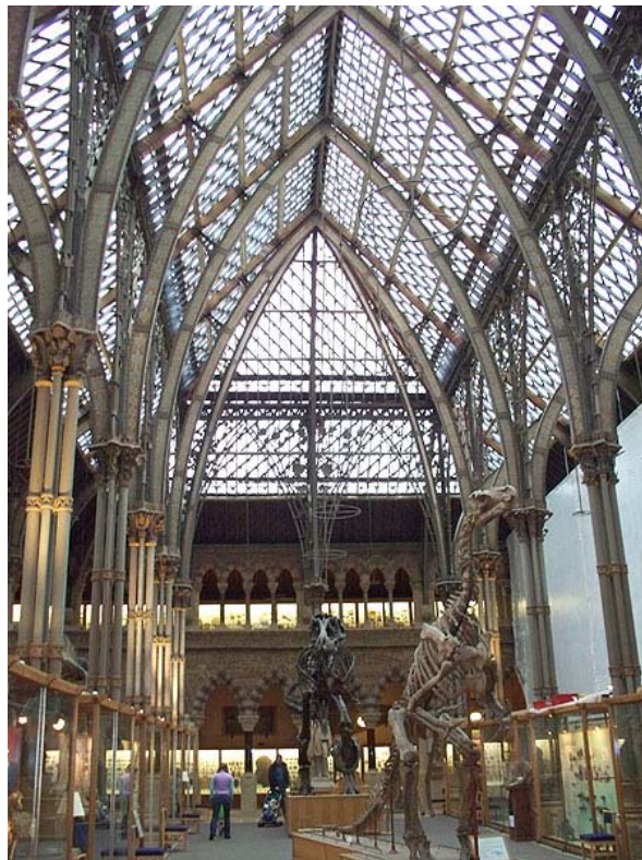
Figure 1: Oxford Science Museum

So what do we actually know about this encounter. It wasn't an actual debate, but occurred during the 1860 meeting of the British Association for the Advancement of Science that was held in the newly constructed Oxford Science Museum.